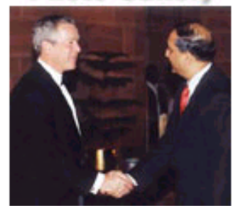
ASSOCHAM - R...